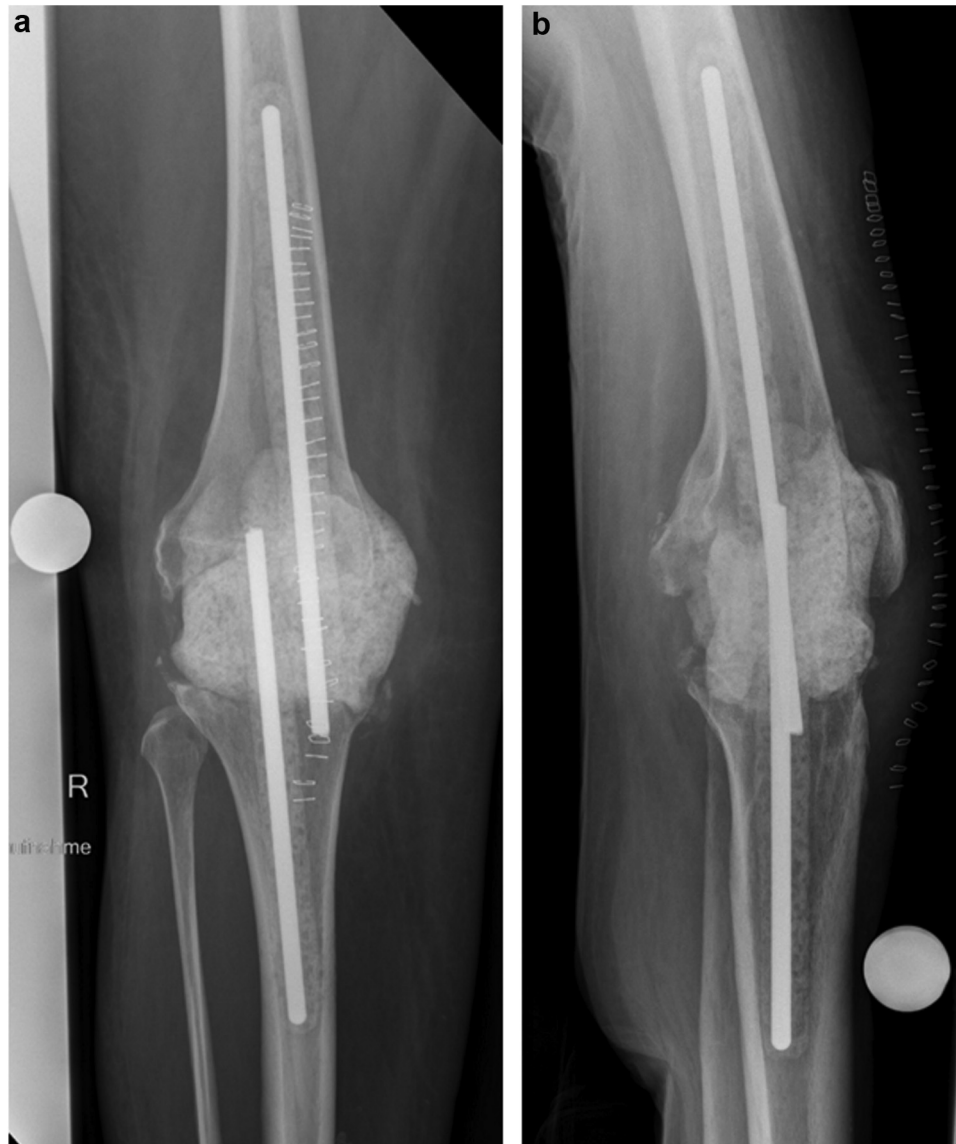
Figure 3. Anteroposterior (a) and lateral (b) radiographs of the spacer impregnated with gentamicin, clindamycin, and voriconazole.

we revised the patient's knee and exchanged the spacer (Fig. 3). The new spacer was loaded with gentamicin, clindamycin, and 600 mg of voriconazole per 40 g of cement. Tissue samples and joint aspirate were positive for fluconazole-sensitive Candida albicans . Post-operatively, we adjusted the antifungal treatment, which now included voriconazole ( 2 \times 200 mg/d) and micafungin (100 mg/d).