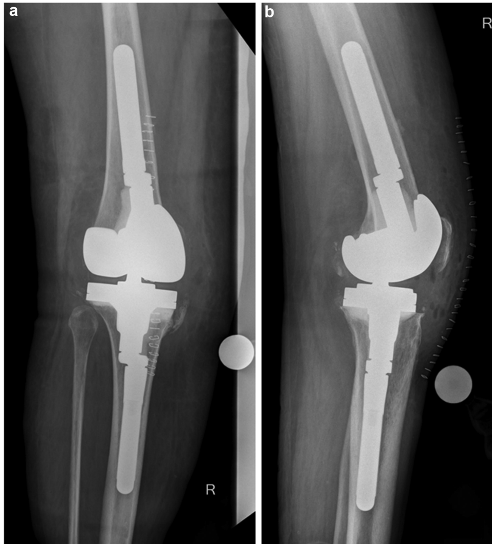
Figure 4. Anteroposterior (a) and lateral (b) radiographs of the right knee after reimplantation of a rotating-hinge revision TKA.

recent studies, serum IL-6 levels in PJI were analyzed and a cutoff value of 13 pg/mL indicating PJI was suggested [9]. However, further studies with a higher number of cases are needed to assess the diagnostic value of IL-6.