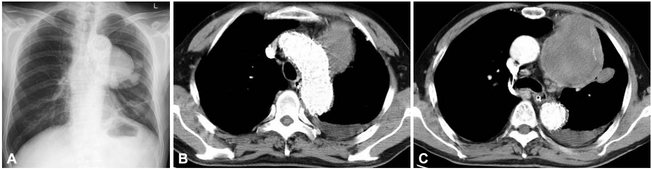
Fig. 5. The chest X-ray shows the improvement of the left atelectasis 7 days after bronchoscopy (A) and the follow up CT scan shows the aortic stent grafts, no endoleak and no thrombus in the aortic arch aneurysm (B and C).