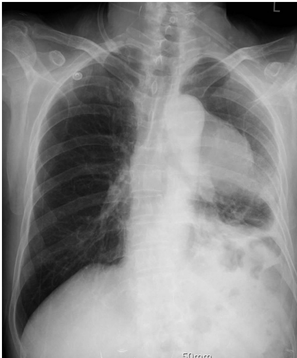
Fig. 1. The chest X-ray shows a mass-like lesion in the left hilar zone.

The initial laboratory findings showed that his hemoglobin level was 8.1 g/dL, white blood cell count was 9.7 \times 10^3/\mu\text{L} and platelet count was 170 \times 10^3/\mu\text{L} . Additional laboratory studies were normal. An electrocardiogram showed normal sinus rhythm without specific abnormal findings and a chest