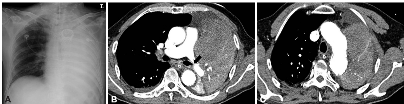
Fig. 4. The chest X-ray shows total atelectasis of the left lung (A). The left main bronchus is compressed due to the posteriorly displaced left pulmonary artery, resulting in left lung total atelectasis on the chest CT scan (black arrow) (B) and there is no endoleak or occlusion of the neck vessels (C).