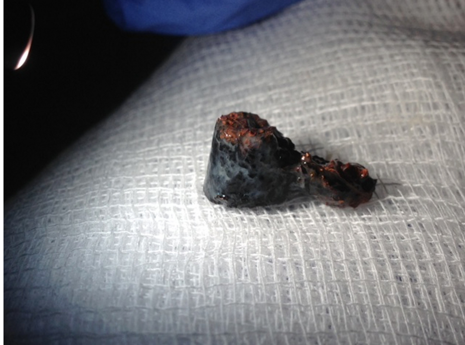
FIGURE 3: Retracted cocaine pipe form the airway.

Using only the forceps, the foreign body was grasped and withdrawn along with the bronchoscope (Figure 3).