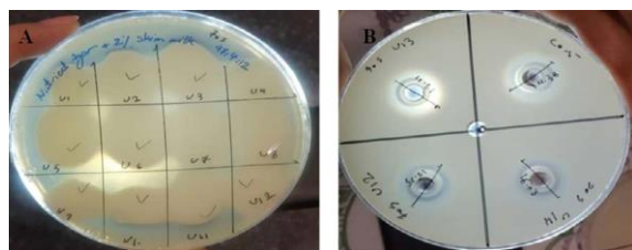
Fig. 2. Primary screening step for selecting mutants with enhanced caseinolytic activity. As it is shown in the picture some mutants lose their proteolytic activity after exposing to UV radiation.

Quantifying protease activity of wild type and mutated L. enzymogenes . Protease activity of wild type and the mutated L. enzymogenes which showed the highest protease activity was checked in liquid media based on equivalent deliberated micromoles of tyrosine. The protease activity of wild type (147 IU ml -1 ) was attained at OD 600 = 0.4, while for the mutant M2, UV 90s was 289.66 IU mL -1 (Table 3).