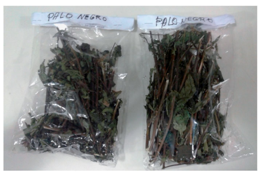
Figure 1. L. rivularis as it is sold in the street markets in Valdivia, Chile.

which could mimic neurotrophic factors, lower the oxidative stress status within the nervous system cells, increment neurotransmitters, or act as neuromodulators to accelerate neurogenesis 12,13. Among the treatment strategies for those degenerative diseases are cholinesterase inhibitors such as galantamine<sup>14</sup>. Phenolic compounds present in extracts from a vast number of edible fruits, mushrooms, and herbs including Salvia officinalis, Melissa officinalis, Laurus nobilis, Mentha suaveolens, Lavandula angustifolia, Lavandula pedunculata showed also anticholinesterase (AChE) activity, and are considered rich sources of molecules useful for the prevention and treatment of those neurodegenerative diseases^{15-17}.\\