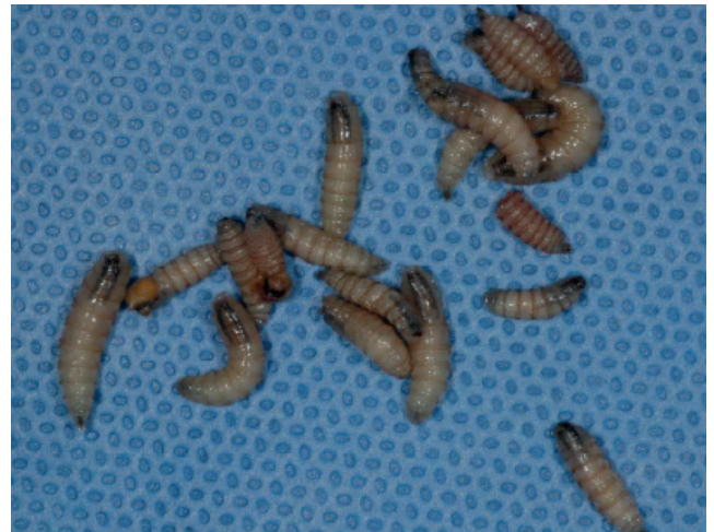
FIGURE 3: Macroscopic appearance of Cochliomyia hominivorax larvae after extraction

on the scalp, such as seborrheic dermatitis and psoriasis. 4,5 In such instances, the term traumatic myiasis is preferred to wound myiasis. Manipulation of the skin lesions in such dermatoses is likely to act as a predisposing factor. In our patient, both mental disability and seborrheic dermatitis could well have contributed not only to the onset of the disease, but also to its exuberant presentation.