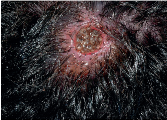
FIGURE 1: Well-circumscribed round ulcer with multiple larvae