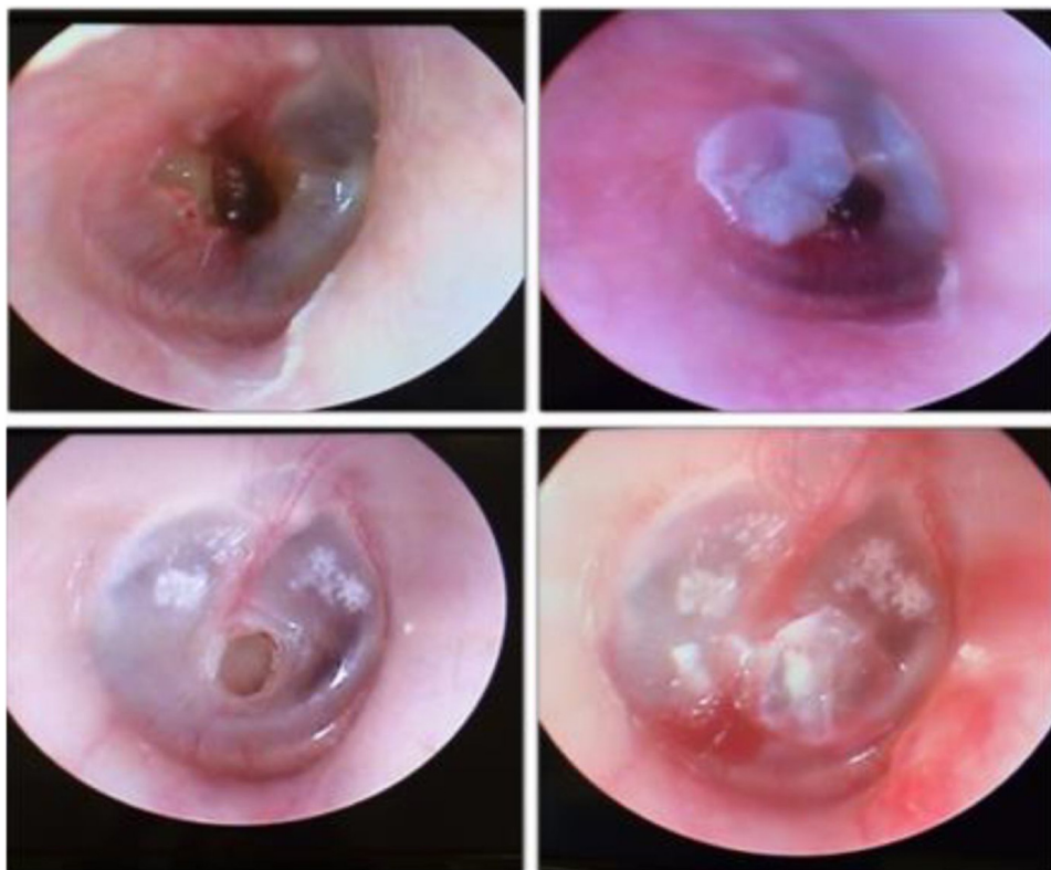
Figure 1 Patients' otoscopy procedures: on the left showing the perforation and on the right, after the cellulose film placement.