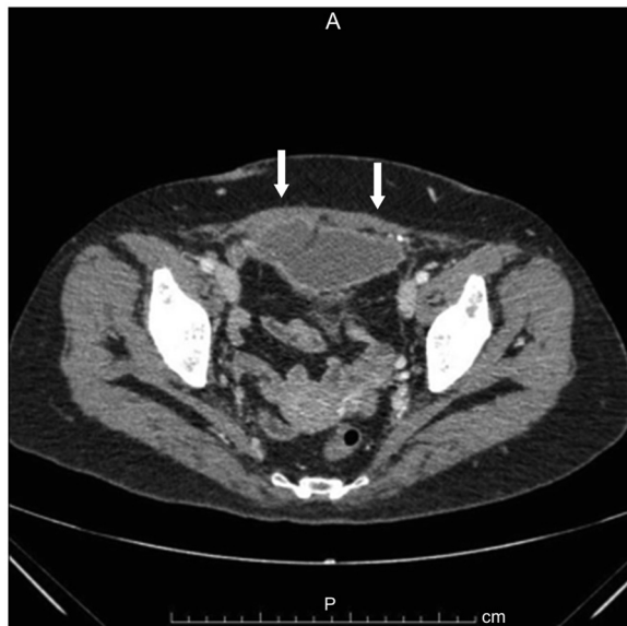
Fig. 3 – A: Follow-up enhanced abdominal computed tomography performed 3 months later reveals that both hematomas have decreased in size/.