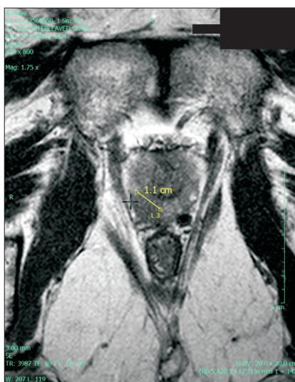
Fig. 1. T2-weighted image demonstrating an area of low signal intensity in the right peripheral zone consistent with prostate cancer.

Adapted from Raz et al. Nat Rev Urol 2010;7:543-51, with permission of Macmillan Publishers Limited [8].