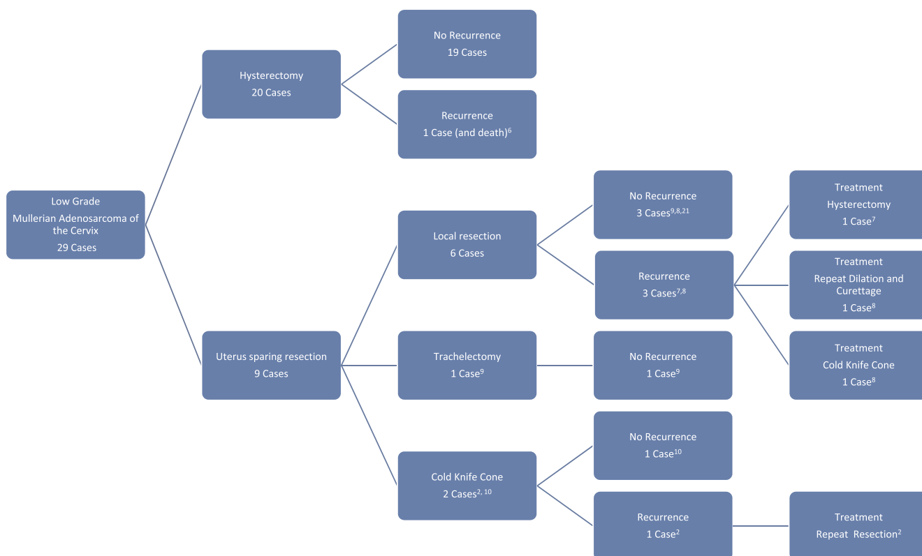
Fig. 2. Flow Diagram Low Grade Mullerian Adenosarcoma of the Cervix Summary of Cases Reviewed.

more minimally invasive resection approach with similar results, which may lead to a better reproductive outcome for patients desiring fertility preservation.