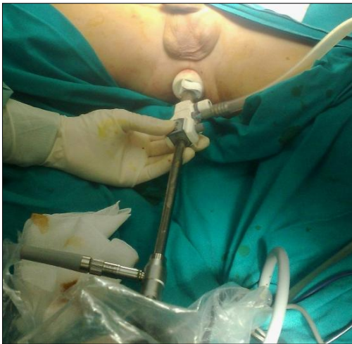
Figure 2: Trocar positioning for the procedure

ing CO 2 . The rectum was sufficiently insufflated to allow a good exposure. There was no leakage of insufflated CO 2 . A 10mm operative scope with a 5mm operative channel was introduced through the uppermost cannula. The lesion was localized, excised using scissors and monopolar coagulation (Fig. 3). In addition multiple rectal biopsies were performed 2 to 4 cm above the anal verge using a bioptic 5mm forceps. Histopathology showed only inflamed and ulcerated granulation-type tissue and the typical characteristics of a chronic inflammatory bowel disease, more likely a Crohn's disease. Patient was discharged the day following procedure. No adverse events were noted to date, including fecal incontinence. He was treated with medical therapy with good control of the symptoms.