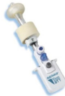
Figure 1: Balloon trocar

area with fecal loading till descending colon. An entero-MRI was performed which showed marked and diffuse thickening (maximum thickness 8 mm) of the walls of the rectum and distal sigmoid colon with the stenosis of the lumen. The nature of the lesions was still unclear; therefore, an excisional biopsy was performed using STTE with an 11mm balloon trocar (Covidien). In addition, for the persistence of constipation, some biopsies on the antimesenteric margin of the upper part of rectum were performed with laparoscopy using 3 5-mm ports in order to exclude other pathologies.