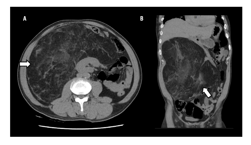
Figure 1 - A) Right kidney dislocated in epigastrium by the retroperitoneal component of the mass. B) Right colon displaced against abdominal wall and most of the small bowel in left side of abdomen.

mixed density and pathological contrast enhancement arising in the retroperitoneum. The mass displaced right kidney in epigastrium (Figure -1A) and most of the bowel away from their natural position in right side of abdomen (Figure-1B). Surgical excision of the mass was performed through a para-midline incision, and revealed a giant clearly encapsulated fatty tumor deriving from the right retroperitoneal fatty tissue (Figure-2A). The mass was completely extirpated without resection of adjacent tissue or organs. The final histopathological report showed a well-differentiated liposarcoma of the retroperitoneum (Figure-2B). The