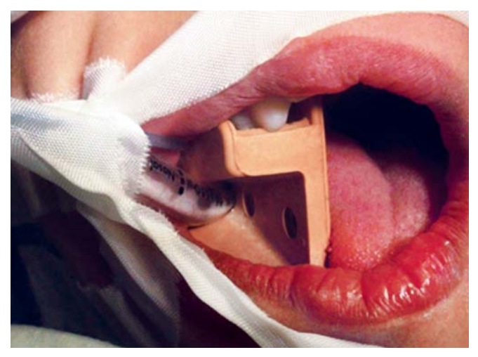
Fig. 1: Tube accommodated inside the mouth gag to economize the use of the intraoral space