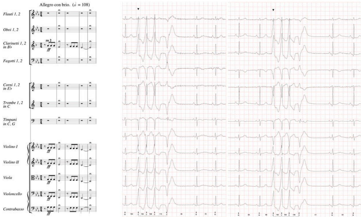
Figure 1 Opening of Beethoven's Fifth Symphony (CCARH 2008) and 12-lead Holter ECG segments showing short runs of ventricular tachycardia matching the fate motif, normal beats marking time (ECG courtesy Lambiase).