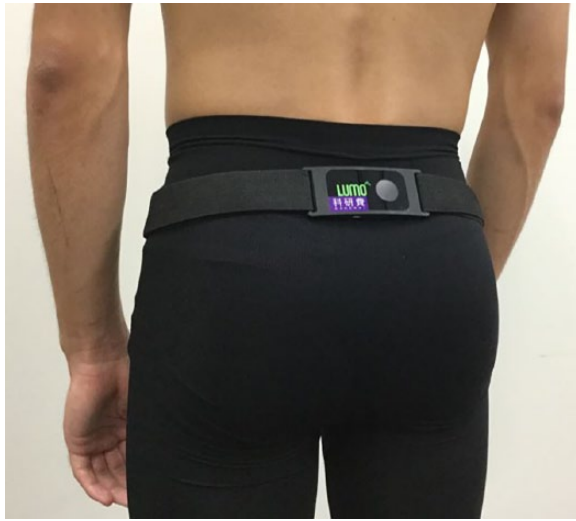
Figure 1. LUMObac. The LUMObac was placed around L5-S1 level.

test–retest reliability (intraclass correlation coefficient (ICC)=.84-.87) for the BodyGuard™ (Sels Instruments,