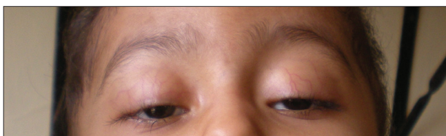
Figure 1: Figure showing bilateral ptosis

Children receiving vincristine need to be monitored closely for dose-limiting complications leading to the development of usually reversible neurotoxicity. Combined treatment with pyridoxine and pyridostigmine may hasten the clinical improvement even in severe cases.