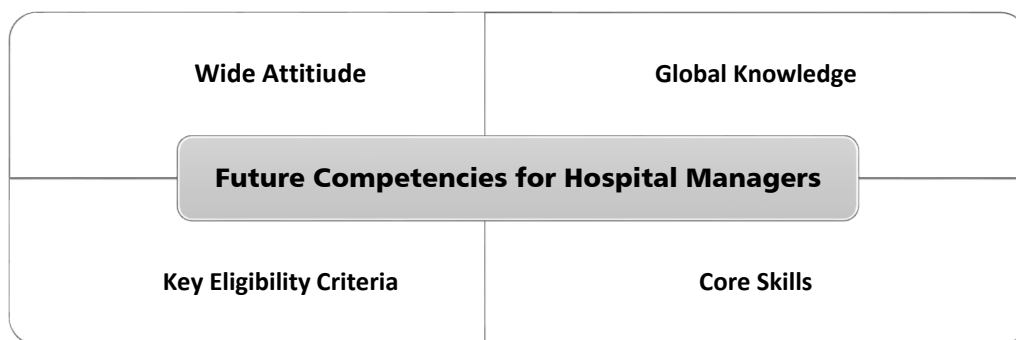
Fig. 2. Four Dimensions of Future Competencies for Public Hospital Managers

The theoretical knowledge is obtained through education at the university level. Development of knowledge is the cornerstone of skills and attitude and does not have much influence on the development of managerial competencies by itself (53, 54). With reviewing the studies on the future competency of hospital managers, 23 knowledge were