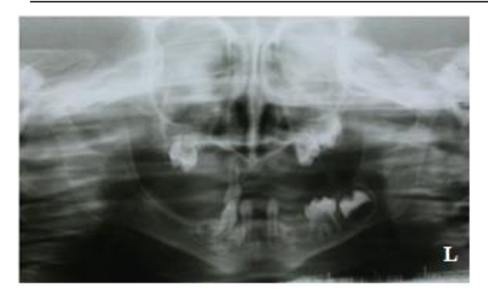
Fig. 1: Panoramic radiograph showing hypodontia and unerupted teeth at age two

and whorls, as well as pale, hairless, atrophic linear streaks or patches) were categorized as major diagnostic criteria for IP; whereas, dental, hair, and nail abnormalities retinal, considered minor criteria for IP. According to the findings of some large case series of IP patients [2,8,14-17], the incidence of dental anomalies in patients with IP varies from 30.86% [14] to 92% [17]. Similarly, the number of dental and/or oral anomalies per patient ranges from 1.48 [8] to 2.48 [17]. Dental anomalies are the most common manifestations of IP patients and are observed in up to 80% of the patients and usually affect both dentitions. Hypodontia is the most common anomaly (up to 43% of patients), followed by pegged or conically crowned teeth (30% of patients) [18]. In this report, we present a patient with IP who had multiple missing teeth in both the mandible and the maxilla, and provide a proper treatment plan for the patient's condition.