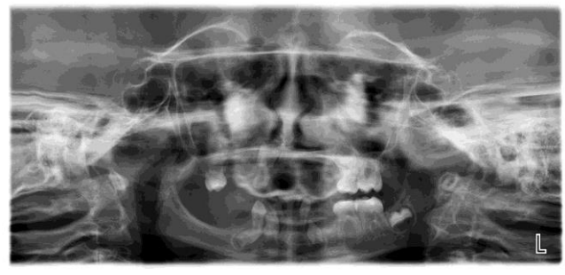
Fig. 4: Pretreatment panoramic radiograph; note the multiple missing teeth in both arches

The patient was initially treated with pulpectomy and composite filling of tooth 52, followed by fissure sealant therapy of teeth 55, 65, 75, 26 and 36 and composite veneering of teeth 52 and 82.