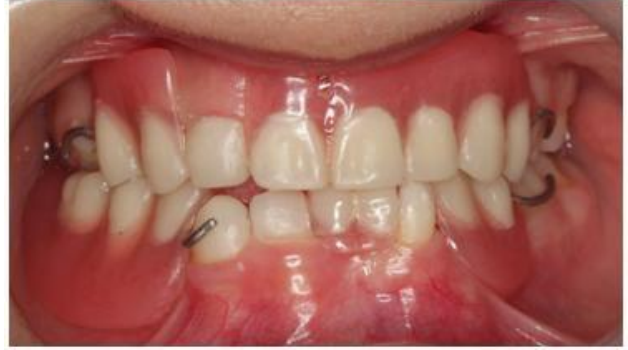
Fig. 5: Intraoral photograph before and after insertion of the interim removable partial dentures

somatic mosaicism or hypomorphic mutation in the NF-kappa-B essential modulator gene [18]. Incontinentia pigmenti is diagnosed in older children and adults by a series of skin manifestations, as well as possible dental, neurologic and eye abnormalities [21]. The clinical findings in this patient were consistent with those reported by others [11,12,22]. Her dental findings consisted of oligodontia, conical and peg-shaped anterior teeth and delayed eruption of primary and permanent teeth [22,23].