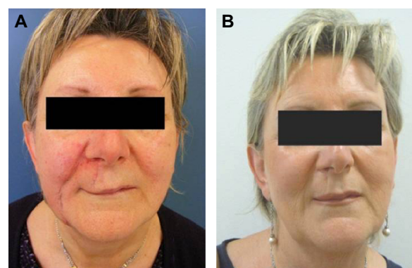
Figure 2 Pre- and post-treatment comparative images.

CMC promoted a significant improvement both in patients' physical appearance and in their self-image and perceived social role due to disguising of body disfigurement. Before treatment, patients had poor self-image and overwhelming social withdrawal induced by the physical illness. The group of patients undergoing CMC experienced a strong recovery of their self-image, with significant improvement of all the vital functional parameters, and self-satisfaction. Their physical appearance no longer gave rise to negative emotions, but instead inspired the patients to take more care of themselves, coupled with feelings of being accepted within social interactions. We believe that CMC could shift patients' attention from their continuously perceived illness to a more positive attitude, where their perceived self-image is fully and harmoniously reintegrated into their emotional life. A key role in recovering such a psychological balance is played out by the close interaction between the desire for improved appearance and improved social relationships. This was demonstrated by the significant reduction of the patient's compulsive control of their physical appearance and the increase of the work related satisfaction.