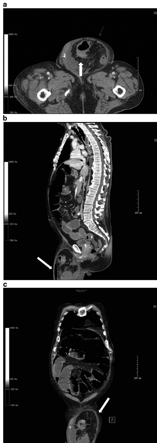
Fig. 2 – Second CT scan of the abdomen including an axial (a), sagittal (b), and coronal (c) image. The a axial image shows the tumor within the scrotum, the small arrows shows bubbles of free air. Notice the sagittal b image where the arrow is pointing toward free air in the scrotum, due to perforation of the sigmoid wall. The white arrow in image c shows the sigmoid tumor in the scrotum