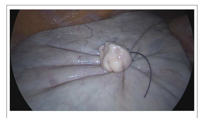
FIGURE 5 | Laparoscopic intraabdominal visualization of the drained ovarian cyst.

two were ASA 1. Symptoms at presentation were varied. Most patients presented an increased abdominal girth and symptoms due to compression such as hydronephrosis, pollakiuria and intestinal sub-occlusion. Patient 6 was asymptomatic, while patient 2 presented with dyspnea.