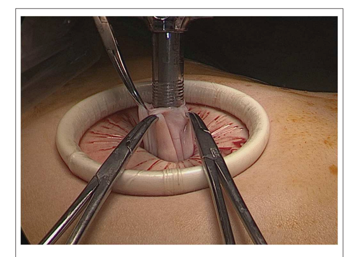
FIGURE 2 | Contained cyst puncture under direct vision using a suction irrigation apparatus through a 12 mm trocar.