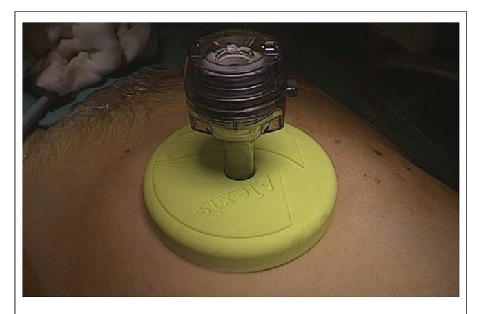
FIGURE 4 | Setup of the Alexis Laparoscopic system® with a cap before creation of the pneumoperitoneum.

Six patients were included in the series. Data are shown in Table 1 . Mean age of operated patients was 59 years, including 2 pre-menopausal patients. Mean BMI was 22.1 (range 18.4–27). Three women were Physical Status score 3 according to the American Society of Anesthesiologists (ASA), one ASA 2 and