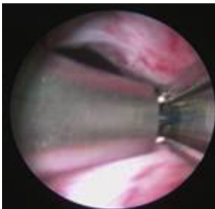
Fig. 3. The glistening white line.

The rate of retreatment in patients was 5% at 1 year, with 1.4% of patients requiring TURP and laser vaporization, in addition to 3.6% of patients requiring PUL revisions. 4 Retreatments at 2 years increased to 7.1%. 6 Rates of retreatment are similar to other published studies including a previously published Australian multicenter study. 2 This study similarly demonstrated a rapid and sustained improvement in functional and clinical outcomes. The decrease in IPSS was immediate, as demonstrated in other published studies [7,8], with a 42% decrease at 2 weeks, and 49% at 6 months. The improvement showed durability with a 42% decrease at 2 years; this improvement in IPSS was statistically significant at all follow-up intervals. BPHII decreased by 39% by 2 weeks, and