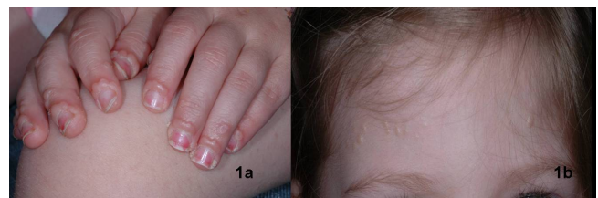
Figure 1 Figures 1a and 1b. Pink, flat topped, smooth papules overlying the proximal nail folds of the hands bilaterally ( 1a ), and on the forehead ( 1b ).

However, she continued to have multiple joint effusions and decreased range of motion in her PIP joints. Therefore, etanercept was added at a dose of 20 mg (1.25 mg/kg) subcutaneously every week. Methotrexate was increased to 12.5 mg (0.8 mg/kg). She had a partial initial response to etanercept with some improvement in the range of motion of her MCP's and wrists. However, after 3 months on etanercept, the patient had significant ongoing polyarthritis, so the etanercept dose was increased to 25 mg (1.5 mg/kg), and methotrexate was increased to 15 mg (0.9 mg/kg). As her prednisone was tapered very slowly, a few tiny xanthomatous lesions reappeared. Due to worsening polyarthritis, etanercept was discontinued, and infliximab was started at a dose of 10 mg/kg intravenously. After 2 infusions given 2 weeks apart, the patient was noted to have improvement with resolution of multiple joint effusions and improved range of motion. In addition, all xanthomas disappeared. The infliximab infusions