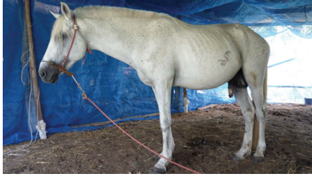
FIGURE 6: Mosquito net system on a stable to protect a horse against biting flies in an area of high infestation, Ratacha Buri, Thailand.