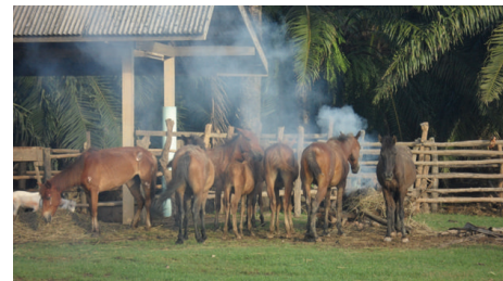
FIGURE 5: Smoke released to protect horses from biting flies, Surat Thani, Thailand.

be used to catch a few bat specimens, which are then used to kill the colony. Captured animals are coated with drops of anticoagulant that contains an excipient, such as lanolin, before they are released. Once the animal has returned to the colony, it spreads the chemical to the whole colony by licking and contact. An anticoagulant, such as chlorophacinone, kills the bats within a few days [23, 61].