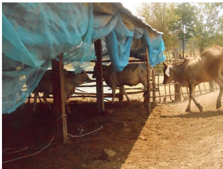
FIGURE 7: Fly proof system with mosquito net for cattle stable (Nakhon Sawan, Thailand).

The case of carnivores is quite unusual. Carnivores may be infected when they eat the bones, flesh, or blood of an infected animal that has only just died. Rodents, which are omnivorous, may become infected like carnivores. T. evansi can be transmitted via oral infection as demonstrated in a trial in which per-oral blood was given to rats and mice [26, 27]. To avoid such infections, the dead animals' carcasses should be eliminated as soon as possible and dogs, especially stray dogs, should be contained around slaughterhouses, as well as on livestock farms in general.