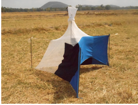
FIGURE 3: Nzi trap. A universal trap able to catch tsetse flies, tabanids, and Stomoxys , especially efficient for large size tabanids.

These are known as the “R” and “K” reproduction strategies, respectively [55].