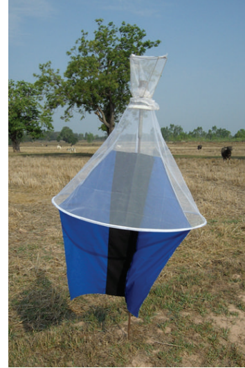
FIGURE 4: Vavoua trap. A trap designed for tsetse flies, especially efficient for Chrysops and Stomoxys .

In Latin America, the vampire bat can act as vector, host, and reservoir of T. evansi . Consequently, vampire bat control is an integral part of surra control. The “Japanese net” can be used to catch vampire bats. It can also be used as a screen to protect livestock. In this case, it should be set up at night to create a screen between the bat colony refuge (forest area) and the livestock farm. Alternatively, the Japanese net can