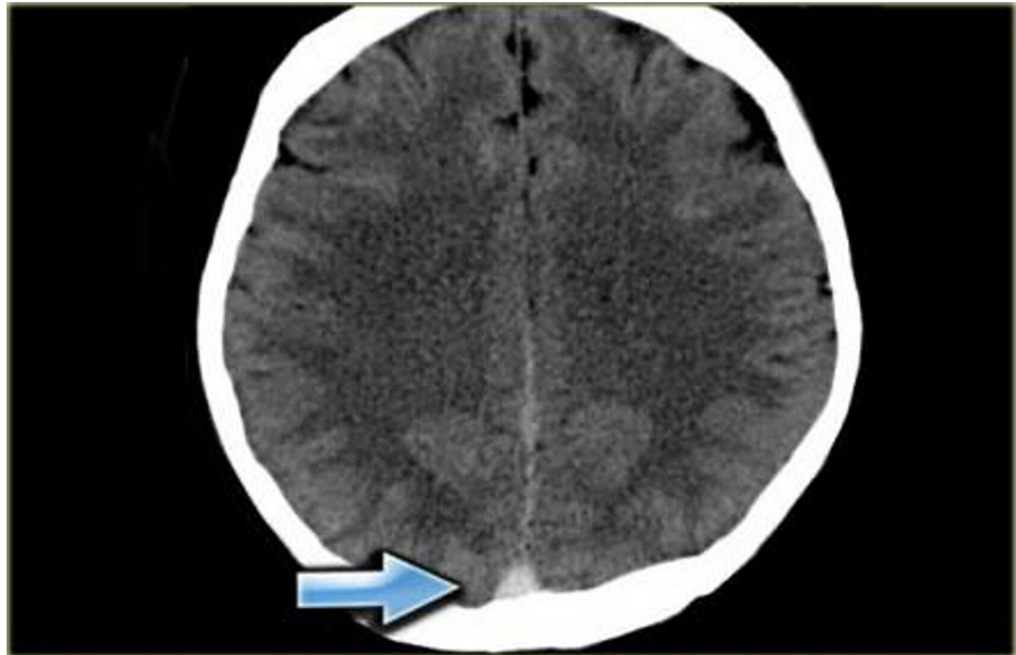
FIGURE 3: CECT brain showing CVST (arrowhead)

CECT: contrast-enhanced computed tomography; CVST: cerebral venous sinus thrombosis