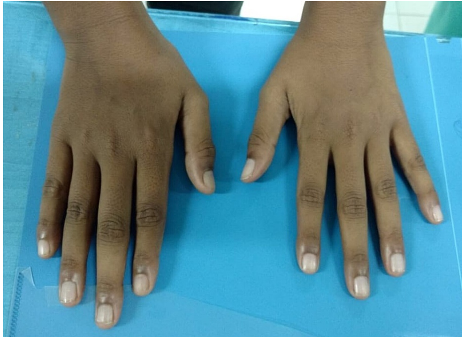
FIGURE 1: Arachnodactyly (Long, slender and curved fingers)

On investigation, complete blood counts revealed hemoglobin 12 gm/dl, total leucocyte count 7800/cu mm and total platelet count 4 lacs /cu mm. C- reactive protein was 2 mg/L, serum sodium 139 mmol/L, serum potassium 4.4 mmol/L, and serum calcium was 9 mg/dL. Ophthalmological examination was done in view of high myopia and revealed ectopia lentis in both eyes (Figure 2). Contrast-enhanced computed tomography (CECT) brain revealed cerebral venous sinus thrombosis (CVST) (Figure 3).