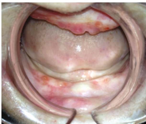
FIGURE 4: The image showing six-week postoperative healing after medicine treatment and gingivectomy.

KS has various clinical symptoms such as acral skin blisters, progressive poikiloderma [1], alopecia, nail dystrophy, acral hyperkeratosis [7], contractures and webbing of toes and fingers [6], photosensitivity [1], and actinic changes [9]. In addition, oral symptoms are very common in this disorder. It was reported that oral manifestations often include severe periodontitis which begins with permanent teeth eruption and progresses rapidly, poor dentition with premature loss of teeth, erosive areas in the labial and buccal mucosa and gingiva, spontaneous bleeding, desquamative gingivitis, angular cheilitis, leukokeratosis of the lips, caries, halitosis, and xerostomia [13]. Clinical and oral manifestations of the present case were similar to those reported in previous studies.