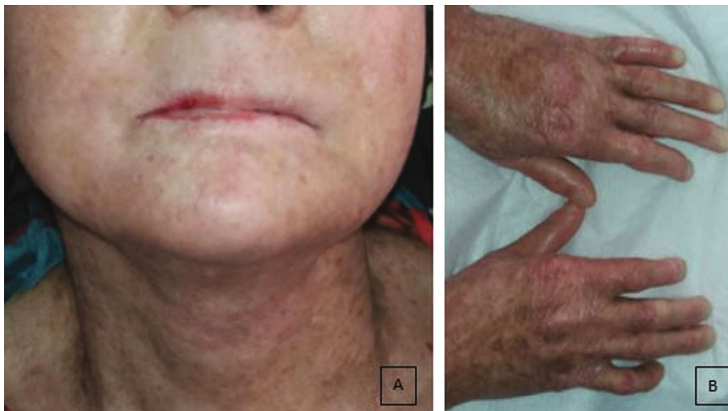
FIGURE 1: (a) The image showing multiple hypo- and hyperpigmented macules, prominent poikilodermatous changes, xerosis, alopecia, and atrophy of the skin. (b) The image showing cigarette paper-like wrinkling on the dorsum of the feet and hands. Atrophy and adhesions were detected in the fingers.