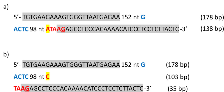
Fig. 1. Schematic representation of fragments produced from 316 bp amplicons after endonuclease digestion a) in A1 or A1-like alleles, and b) in A2 or A2-like alleles.

Primers used for PCR reactions are highlighted in gray. Restriction sites for HinfI and DdeI endonucleases are showed in bold blue and red fonts, respectively. The SNP that determines the amino acid at position 67 of the \beta -casein protein and distinguishes A1- from A2-like alleles based on the band pattern obtained after restriction enzyme digestion is highlighted in yellow. The nucleotide that creates a restriction site by directed mutagenesis in the PCR step is underlined (it is a cytosine in GenBank Accession No. X14711.1 reference sequence).