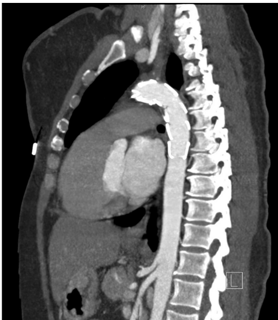
Fig 2. Adequate position of the stent graft with resolution of the thrombus at 18 months.

Because of her guarded neurological prognosis, noninterventive therapy was initiated in the form of therapeutic anticoagulation with unfractionated, intravenous heparin. Repeat imaging studies 25 days after her initial presentation showed complete resolution of the aortic thrombus.