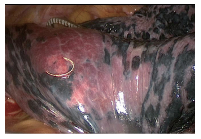
Figure 2 The deep lesion was located by the microcoil on the visceral pleura surface under thoracoscopic guidance.