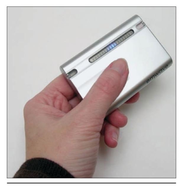
Figure 1 The emWave Personal Stress Reliever.

The sample investigated in this study was selected at random from the cardiac center registry at the Prince Sultan Cardiac Center in Hufuf, Saudi Arabia, for potential inclusion in the study. The inclusion criteria for hypertension were a systolic BP of greater than 140 or a diastolic BP of greater than 90. Sixty-two patients were recruited to participate in the study. Prior to the experiment, the examiner explained to the patients the aim of the study and the procedures they would be asked to participate in.