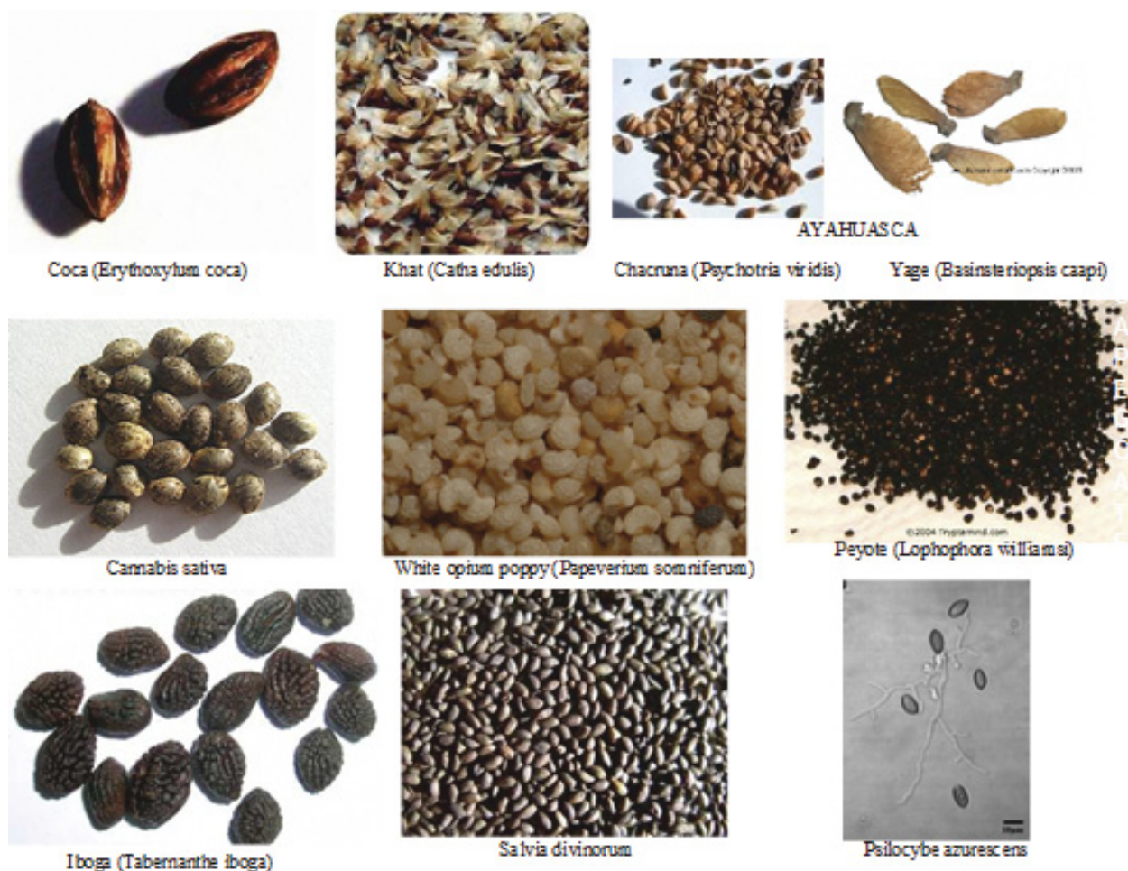
Figure 1 Key Contraband Germplasms. (from top left, rightward) Coca: http://web.archive.org/web/20061018053434/http://www.ethnogarden.com/cart/index.pl/catid_77/proid_292/_/_/CocaSeeds/ErythroxylumCoca , Khat: http://www.shamanica.com/Catha%20edulis.asp , Chacruna: http://web.archive.org/web/20061018155352/http://www.ethnogarden.com/cart/index.pl/catid_77/proid_250/_/_/Chacruna/PsychotriaViridis , Yage: http://www.shamanic-extracts.com/xcart/shamanic-products/banisteriopsis-caapi-seeds.html , Cannabis: http://www.cannabisculture.com/articles/4477.html , Opium: http://www.plantcultures.org.uk/plants/opium_poppy_traditional_medicine.html , Peyote: http://tryptamind.com/grow_peyote.html , Iboga: http://www.shamanic-extracts.com/xcart/shamanic-products/tabernanthe-iboga-seeds.html , Salvia Divinorum: http://www.sagewisdom.org/sdseeds.html Psilocybe: http://www.erowid.org/plants/mushrooms/mushrooms_cultivation_az2.shtml .

species of life such as the Salt Creek tiger beetle ( Cicindela nevadica lincolniensis ), the African violet ( Saintpaulia ionantha ), and the White Rhinoceros ( Ceratotherium simum ) are also subject to criminal sanctions. Exceptions are commonly granted in both cases, and criminal penalties are rarely delivered. Governments' exertion of authoritative biogeographic control as per their international treaty or convention obligations over potentially mass violence-causing biological agents and species threatened with extinction has not led massive civil/political unrest or strife, mainly because these policies do not undermine basic social goals of peace, development, and sustainability. In essence, there is no valued benefit to exposing people to highly virulent pathogens or to wiping out endangered species that is being undermined, although these