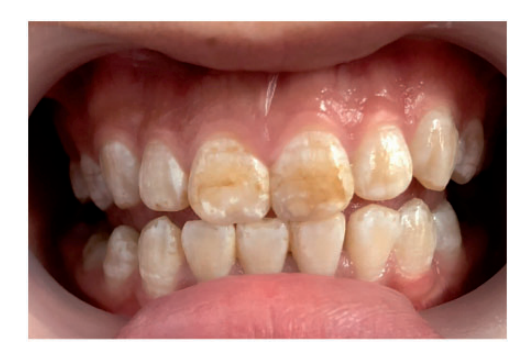
Figure 1. Frontal photograph before whitening treatment. The Tooth Surface Index of Fluorosis score was 4.

That patient had a bilateral class I molar occlusal relationship and demonstrated