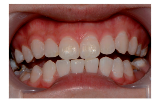
Figure 5. Frontal photograph after resin infiltration treatment.