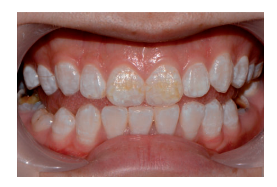
Figure 2. Teeth with severe dental fluorosis were treated with microabrasion and at-home bleaching. Some brown stains remained in the maxillary central incisors.

Resin infiltration therapy was initiated 2 weeks after completion of the at-home bleaching, following resolution of dentin hypersensitivity. Before resin infiltration, the brown stains on the facial surfaces of maxillary central incisors were removed by means of macroabrasion with a water-cooled fine tapered diamond bur (no. 3195 FF; Mani Inc., Utsunomiya, Japan) (Figure 3). Affected teeth were then rinsed and thoroughly cleaned with a large amount