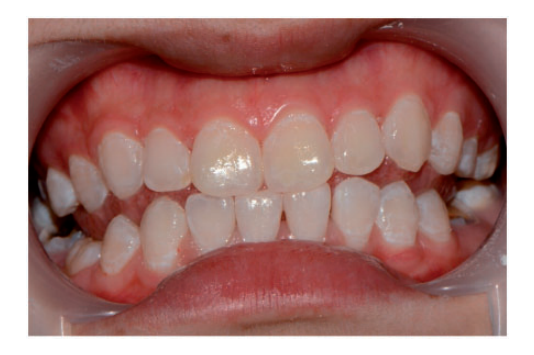
Figure 6. Frontal photograph at 1 week after completion of treatment. The final Tooth Surface Index of Fluorosis score was 1.