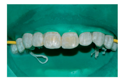
Figure 3. Brown stains on the facial surfaces of maxillary central incisors were removed by macroabrasion with a water-cooled fine tapered diamond bur (no. 3195 FF) before resin infiltration.