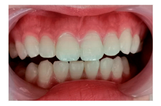
Figure 7. Excellent esthetic appearance was maintained at the 2-year follow-up visit.

enamel surface, wider gaps between enamel columns, larger micropores, and disordered crystal arrangement. Moderate and severe DF are characterized by the loss of