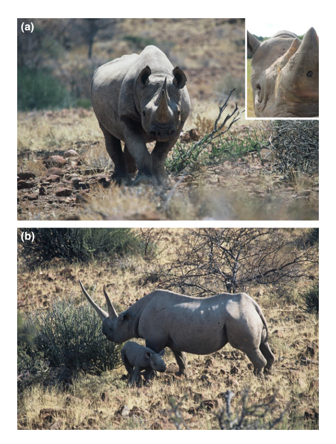
Fig. 1. Real-time poaching-alert tags could prevent the imminent extinction of rhinos. (a) A black rhino Diceros bicornis bull in Damaraland, Namibia, home to one of the last free-living populations of this critically endangered species; photograph: Tom Collier. Inset: real-time poaching-alert tags could be fitted inside rhinos' horns (cf. Fig. 2). Here, a captive black rhino bull has been fitted with a miniature video camera during pilot trials carried out at Port Lympne Wild Animal Park, Kent, UK; photograph: Paul O'Donoghue. (b) A black rhino cow and calf feeding on Euphorbia, in Damaraland, Namibia. With its large horns, a mature individual like this is a prime target for poachers. The calf of the slaughtered mother would simply be left to die; photograph: Tom Collier.

Our proposal aims at increasing the effectiveness of a widely used approach for protecting the most critically endangered species, the deployment of mobile, armed anti-poaching units (Milliken & Shaw 2012). While these teams are often highly trained and well equipped, they generally have no way of knowing the exact time and location of poaching events. Since many target species are wide ranging and live in inaccessible habitats, this means that carcasses are often only found days or weeks after death (Martin 2001). As a result, arrests of poachers are rare and resources are mainly being focussed on securing evidence (Wasser et al. 2008), which is often insufficient for successful prosecution. Our proposed real-time poaching-alert systems would enable rangers to head towards crime scenes with rapid response times, substantially increasing the chances of apprehending suspects. In conjunction with legislation that ensures the severe punish-