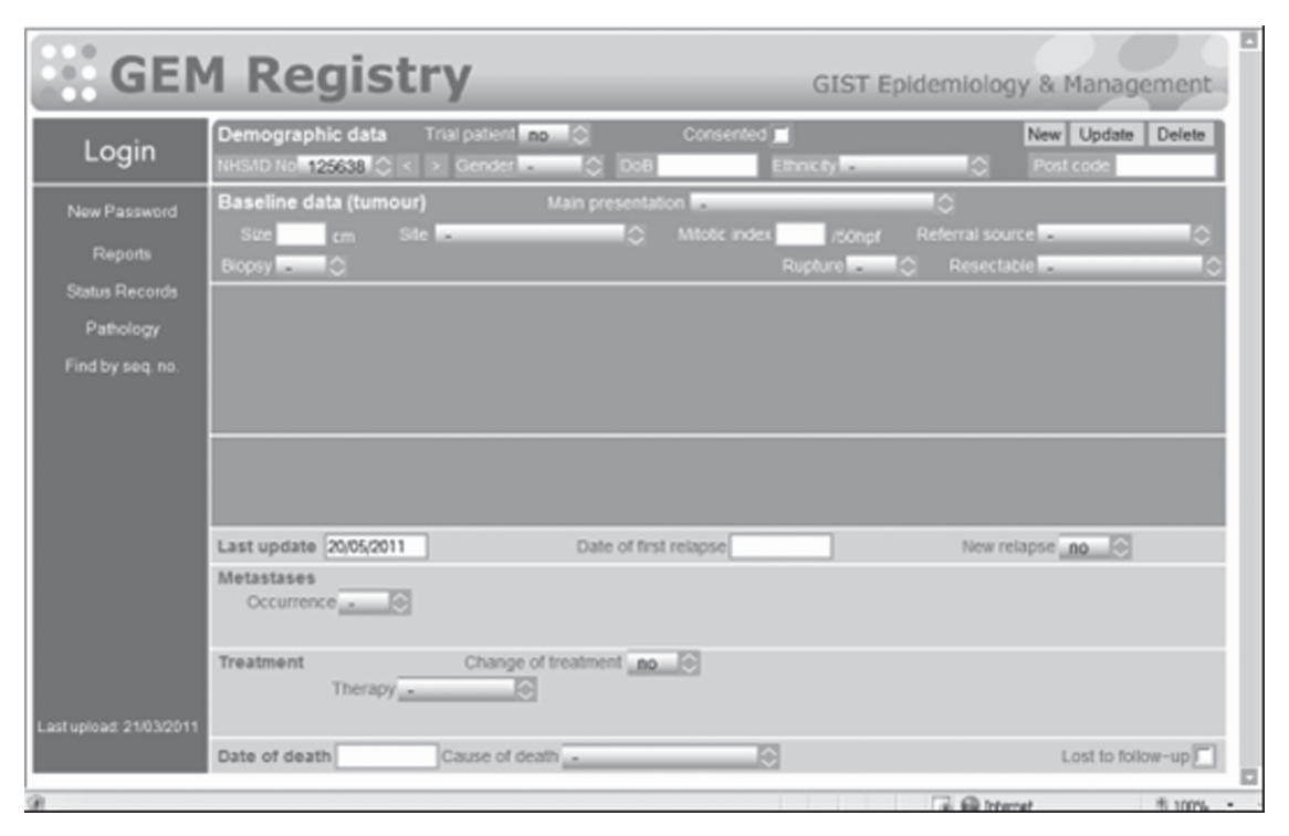
Figure 2. Main data input page of the GEM Registry.