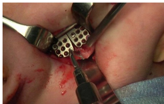
Fig. 3. (A) Pre-op 3D CT showing severe mandibular hypoplasia with retrognathia at 6 weeks old. (B) Post-op 3D CT showing normal mandibular development two years after the distraction procedure.

The baby was treated by applying distraction KLS-Martin micro devices (Zurich) placed through an external Risdon-type incision. After two days latency, the activation rates were 1.5 mm per day based on a three-per-day rhythm. The activation period was 15 days with a 60 day consolidation period. The osteotomies were performed externally using a Piezosurgery device manufactured