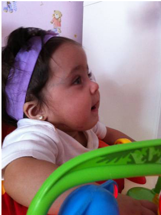
Fig. 4. The baby at 28 months with normal appearance and function.

adjacent soft tissue. The Piezoelectric ultrasound osteotomy device is ideal for complex surgical sites where soft and delicate structures are very close to the osteotomy lines; this is due to its selective cut, which works only on mineralized structures [2]. Osteotomy of the ramus of the mandible is probably the most crucial step of the surgical procedure in early mandibular distraction [8].