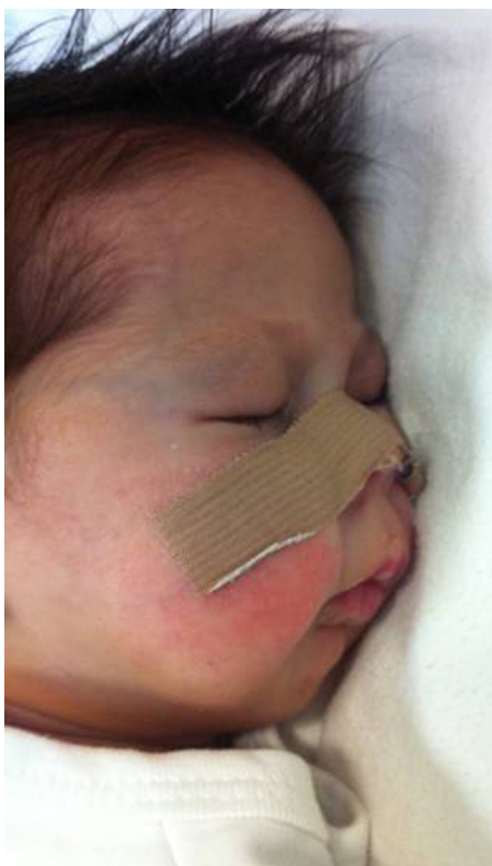
Fig. 1. A 6-week-old female with Pierre Robin sequence.

unit with severe airway obstruction and tracheostomy (Fig. 1). Pre-operative flexible video laryngoscopy showed limited movement of the dorsum of the tongue to the posterior pharyngeal wall and collapse of the epiglottis.