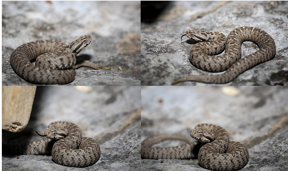
FIGURE 1: The famous Lebanese viper Montivipera bornmuelleri .

The image is captured by Dr. Rabih Awad (coauthor) at the site where the snake attacked the patient, the night following the injury. It is described by the villagers - and later on by the patient - as the snake responsible for the injury.