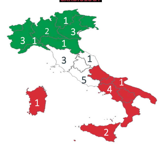
FIGURE 1 Location of the 28 Italian study centers participating in the itAlian pRospective Study on CANGrELOr study

The study evaluated the incidence of any hemorrhages, calculated as the ratio between the number of patients experiencing at least one event