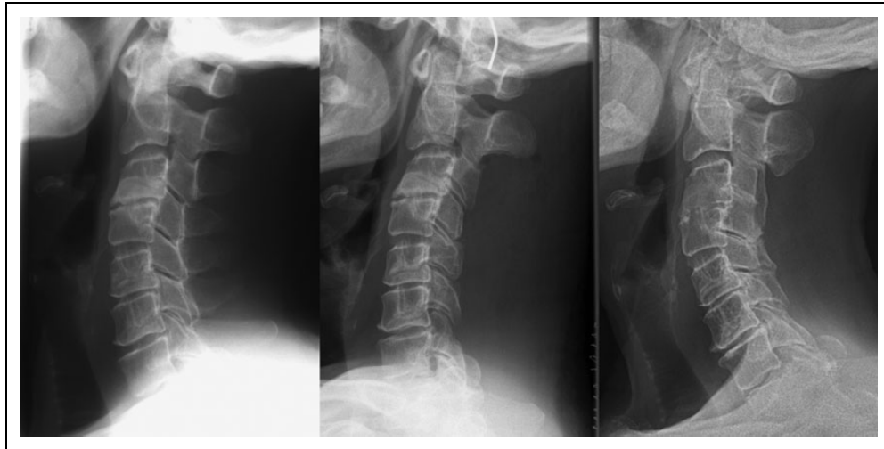
Figure 2. Images preoperative (left), postoperative (center), and at follow-up 11 years postoperatively (right) from the same patient, displaying changes typical of those seen in our study during follow-up. Reduced lordosis postoperatively but regained at follow-up. Increased cSVA and C7 slope at follow-up. The patient had mild neck pain at follow-up and rated the neck pain as improved compared with preoperatively. She was satisfied with the overall outcome.

a Cervical lordosis was measured by C2-C7 Cobb angle.