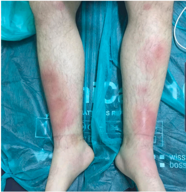
Fig. 1. Photography of the skin lesions visible as bilateral multiple erythematous and indurated plaques in the malleolar and pretibial areas.