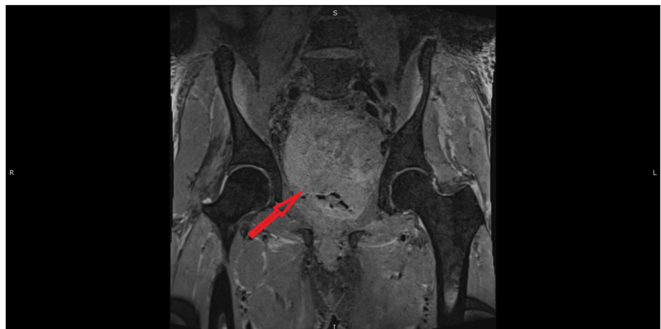
FIGURE 2: MRI (coronal view) of the pelvis showing large pelvic mass (red arrow)