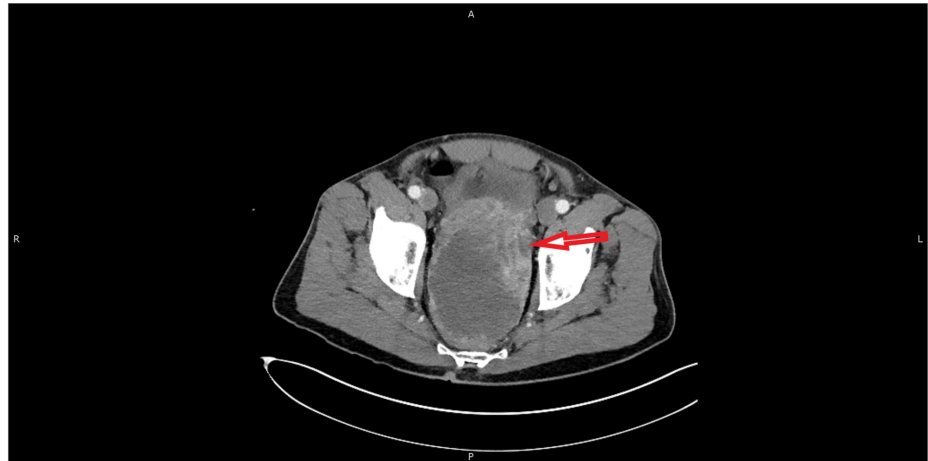
FIGURE 3: MRI (axial view) of the pelvis with contrast showing large pelvic mass fistulizing with the rectum (red arrow)

A multidisciplinary team including a musculoskeletal oncologist, urologist, radiation oncologist, and colorectal surgeon was formulated, and radiation therapy (RT) in an attempt to shrink the tumor was initiated. Finally, the patient underwent pelvic exenteration surgery considering extensive local tumor burden, and systemic chemotherapy was planned afterward. This is a very rare case of STS of the pelvis presenting with acute urinary retention and bloody diarrhea.