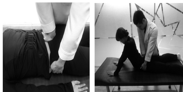
Fig. 2. Anterior innominate of MWM

dividing them into two groups: a joint mobilization group, and a control group.