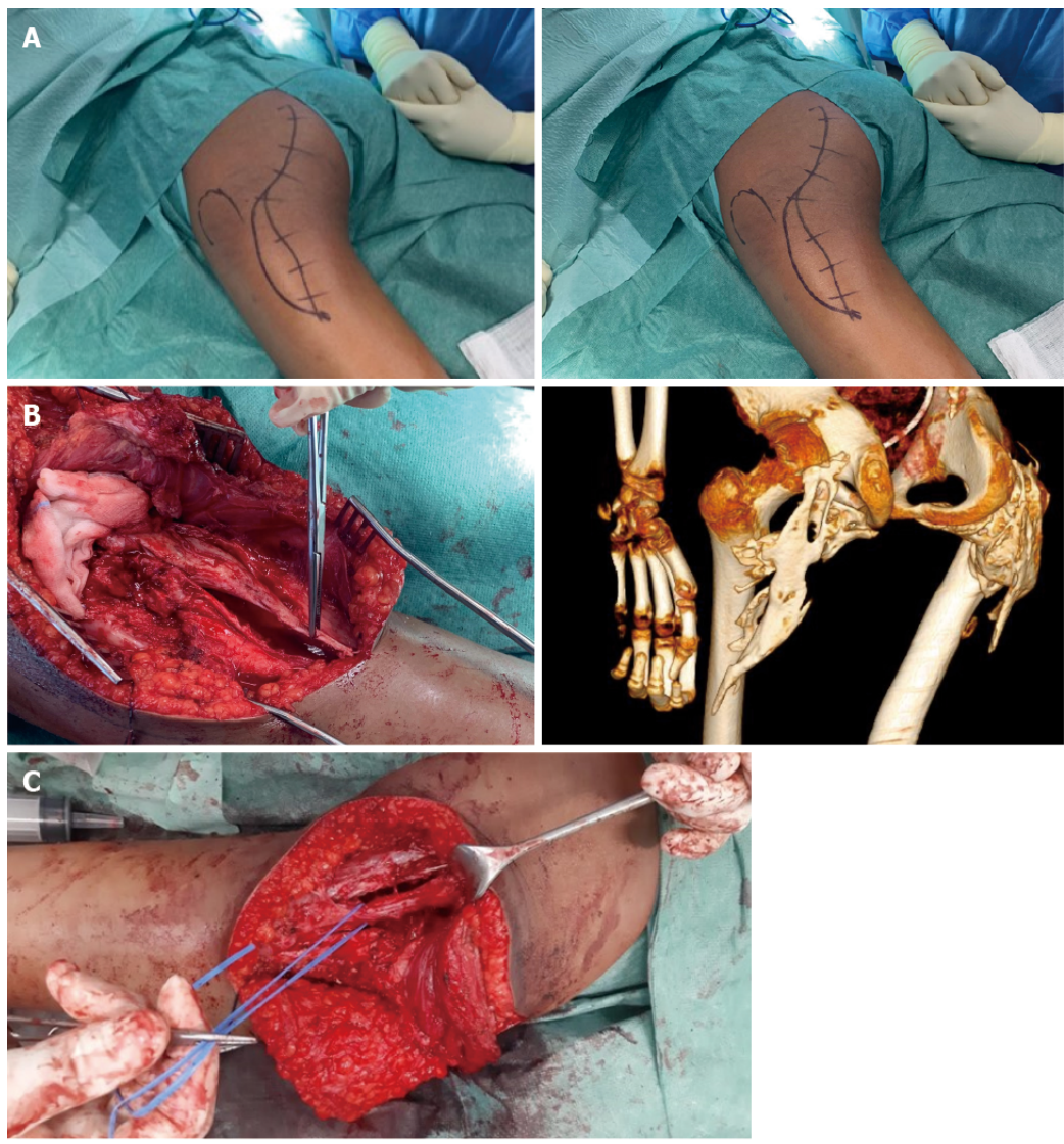
DOI: 10.5312/wjo.v13.i8.768 Copyright ©The Author(s) 2022.

Figure 4 Intraoperative views. A: Lazy "S" incision in the gluteal region; B: Resection of ossified lesions; C: Release of the sciatic nerve path.