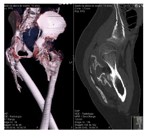
DOI: 10.5312/wjo.v13.i8.768 Copyright ©The Author(s) 2022.

Figure 1 Antero-posterior pelvic radiograph showing extensive bilateral heterotopic ossification.