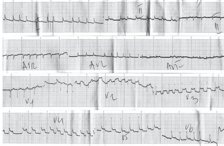
FIGURE 1: ECG shows signs of absolute arrhythmia, HR of 140/min, and ST elevation from V2 to V6, D1 and D2.