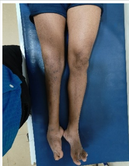
Figure 3: Wasting of quadriceps in affected limb.