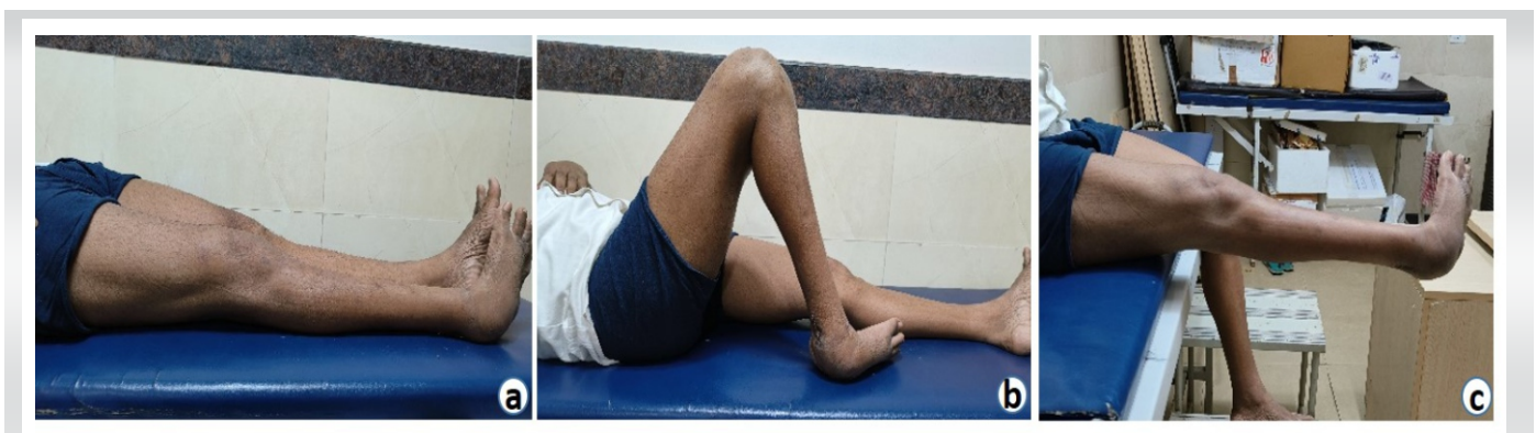
Figure 6: 6 weeks Postoperative images showing full extension and 120° flexion.