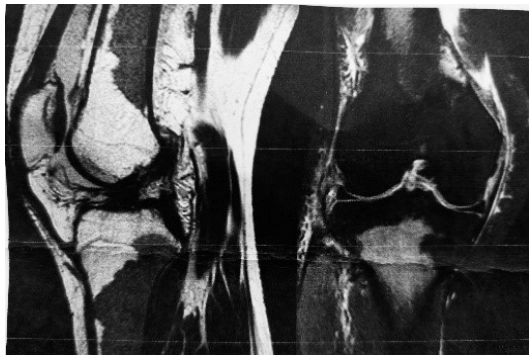
Figure 4: MRI findings showing complete ACL tear.