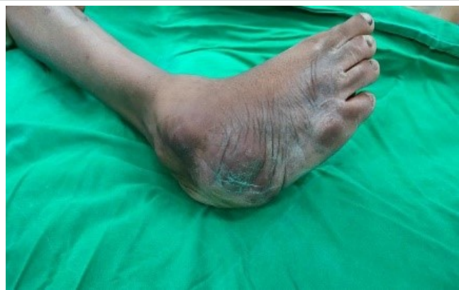
Figure 1: Equinovarus deformity at foot.

narrowing of the femoral and tibial canals, diminished quadriceps strength, flexion contractures and genu recurvatum are some of the characteristics in a poliotic limb. Additionally, a wide range of hindfoot and ankle abnormalities, such as equinus, calcaneus, varus, valgus, pes planus, and cavus, as well as combinations of these (such as equino-varus, equino-valgus, calcaneo-varus, calcaneo-cavo-valgus, and equino-cavo-varus), are also reported. These factors make a poliotic limb more prone to ligament injuries.