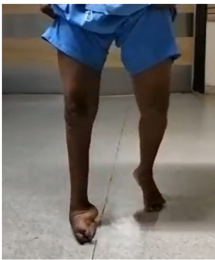
Figure 2: Patient walking full weight bearing on affected limb, preoperatively.

The patient was operated under spinal anaesthesia. Standard arthroscopic portals