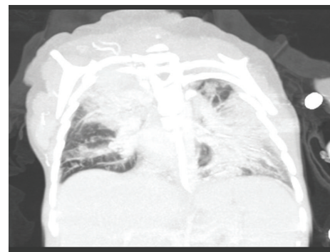
FIGURE 1: CT scan showing mediastinal enlargement and bilateral infiltrates.

Cultures from bronchoalveolar lavage remained negative for bacteria, including mycobacteria. PCR for viruses (CMV, EBV) and mycoplasma were negative. Because a slight lymphopenia was observed in the routine blood sample, an immunological work-up was performed (Table 1). Hypogammaglobulinemia was observed. Antibodies against the received childhood vaccinations (pneumococcus, tetanus, rubella, polio, and hepatitis B) were all negative. Revaccination with Pneumo 23 and tetanus did not lead to an increase in the antibody titers. T cell numbers were