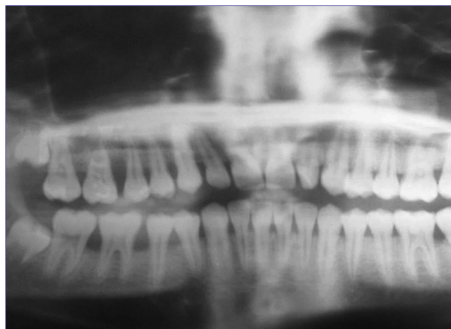
Figure 2: Radiographic picture