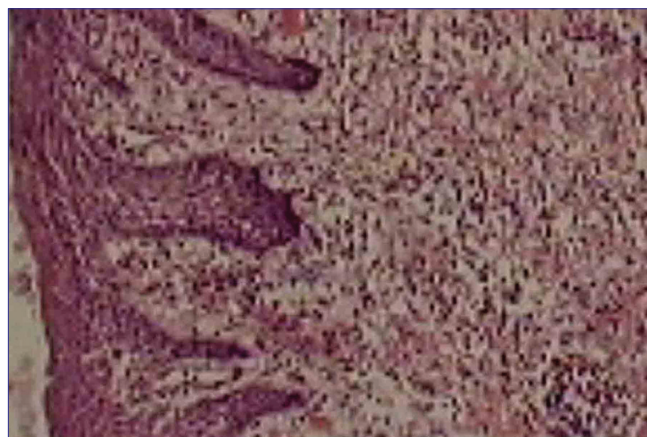
Figure 4: Histopathological picture

There was no recurrence of gingival enlargement until 1 year later [Figure 5]. Probing pocket depth of 2–3 mm was achieved (improvement of 4–5 mm) while there was a relative clinical gain of attachment. There was also improvement seen in the attachment levels which was evident radiographically.