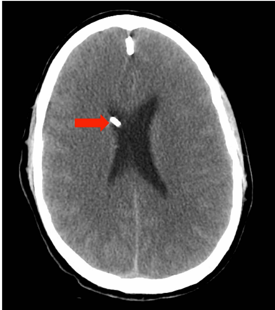
FIGURE 1: Computed tomography of the head without contrast showing right frontal external vascular drain placement (red arrow). Also evident is diffuse loss of gray/white differentiation.

with lorazepam and propofol. Serial head CT scans were suggestive of possible development of cerebral edema. Nephrology performed emergent hemodialysis and recommended IV furosemide. Due to concern of a urea cycle disorder, the patient was administered ornithine, citrulline, and sodium benzoate. These interventions brought the patient's ammonia down to 46 \mu\text{g}/\text{dL} . Our facility did not have the standard treatment for urea cycle disorders of phenylacetate and sodium benzoate available. The patient was transferred to another facility the next day because it was unclear if the hyperammonemia had fully resolved or if ammonia would continue to accumulate. Before transfer, central venous access was obtained and antibiotics covering urease-producing bacteria were given, including ceftriaxone, azithromycin, and clindamycin. A right frontal external vascular drain with an opening pressure of 30 \text{cmH}_2\text{O} was placed by neurosurgery for worsening cerebral edema (Figure 1). The opening pressure improved to 4 \text{cmH}_2\text{O} after external vascular drain placement.