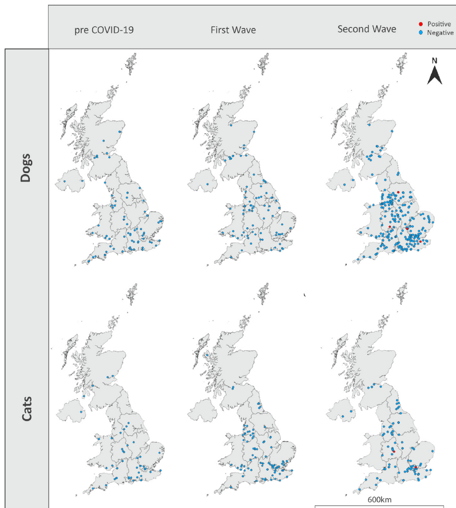
Fig. 1. Schematic map showing the location of samples for which testing of SARS-CoV-2 neutralising antibodies is reported. Red dots indicate samples that were positive for SARS-CoV-2 neutralising antibodies using PRNT 80 . Blue dots indicate samples that were negative. (For interpretation of the references to colour in this figure legend, the reader is referred to the Web version of this article.)

Serum samples were screened for SARS-CoV-2 neutralising antibodies using the plaque reduction neutralisation test (PRNT) as previously described (Patterson et al., 2020a), with the SARS-CoV-2/human/Liverpool/REMRQ0001/2020 isolate cultured in Vero E6 cells (Patterson et al., 2020b). Briefly, sera were heat inactivated at 56 °C for 30 min and stored at -20 °C until use. DMEM containing 2% FBS was used to dilute sera ten-fold followed by serial two-fold dilution. SARS-CoV-2 at 800 plaque forming units (PFU)/ml was added to diluted sera and incubated at 37 °C for 1 h. The virus/serum mixture was then inoculated onto Vero E6 cells, incubated at 37 °C for 1 h, and overlaid as in standard plaque assays (Rossi et al., 2015). Cells were incubated for 48 h at 37 °C and 5% CO 2 , fixed with 10% formalin and stained with 0.05% crystal violet solution. PRNT 80 was determined by the highest dilution with 80% reduction in plaques compared to the control. Samples with detectable neutralising antibody titre were repeated as technical replicates for confirmation. Where titres differed between technical replicates, the lowest dilution was reported.