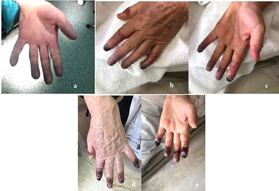
Fig. 1. (A) The cyanosis at the palmar surface of the hand and the fingers on admission. (B,C) The cyanosis was limited to the distal phalanges on the 12th day. 1.d.e. The necrotic areas at the distal phalanges before the amputation of the fifth finger and the debridement of the second, third and fourth fingers.