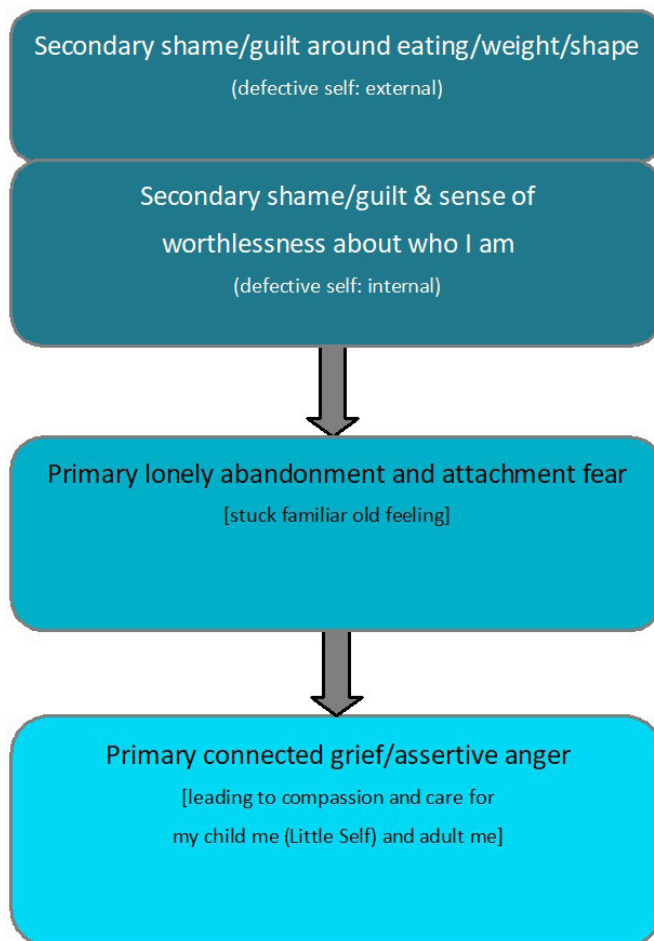
Figure 1 SPEAKS emotion change process. SPEAKS, Specialist Psychotherapy with Emotion for Anorexia in Kent and Sussex.

This trial comprises part of the Specialist Psychotherapy with Emotion for Anorexia in Kent and Sussex (SPEAKS) programme which aimed to develop and test in a feasibility study an emotion focused intervention for adults with anorexia (the SPEAKS intervention). This research programme sought to overcome several key difficulties with the development and application of some earlier interventions, such as unsuccessful targeting of variables or lack of clarity on how change is achieved. The SPEAKS programme proposes focussing on a core clearly defined model with one key putative maintaining process (emotional experience in AN) and following an 'interventionist-causal model approach'. 16 By developing a new model of the development and maintenance of AN drawn from integration of quantitative and qualitative research, it seeks to ensure an emotions' focus. 17 The SPEAKS intervention hypothesises a clear and testable change process to be targeted in therapy (figure 1) 18 ; thus affording the ability to examine proposed mechanisms of change enabling further evidence-based development and refinement of the model. This body of work involved close partnering with stakeholders including those with